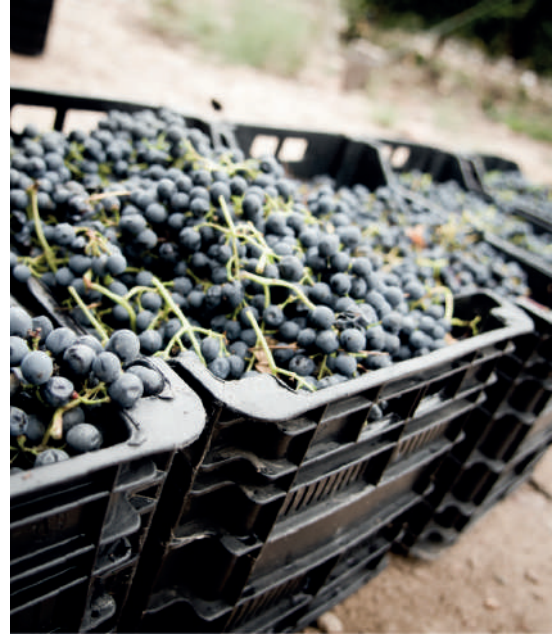
Harvest at Finca Alto Agrelo.

For the whites , in Mendoza, we had an early ripening on the grapes, as in all varieties in general. Despite the fact that February was very rainy, the sanity was good and this helped to offset the acceleration of maturity, preserving the aromatic and fresh profile of varieties such as Sauvignon Blanc and Viognier.